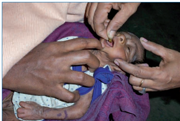
Vitamin A dosing of newborn infant

were given either the vitamin A (n=1,034) or control (n=1,033) treatments and followed up to 12 mo. 1 There was a surprisingly large difference in infant mortality, with a relative risk ratio of 0.36 – that is, 64% fewer deaths in the vitamin A group (n=19) compared with the controls (n=7) at 12 mo ( Table 1 ). The